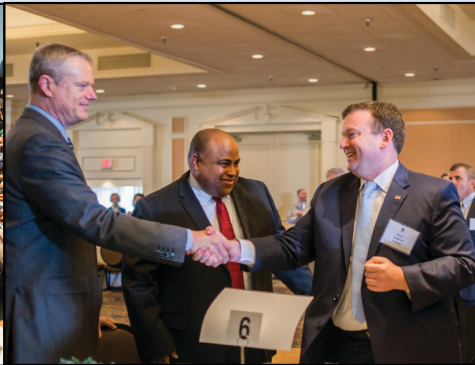
6th Annual Celebration of Giving May 12, 2020

Visit eccf.org/IFT for more information.