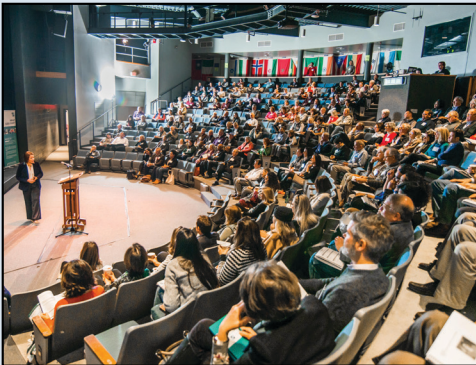
11th Annual Institute for Trustees March, 14 2020

More than 400 attendees attend this annual full day conference for nonprofit leaders and their trustees.