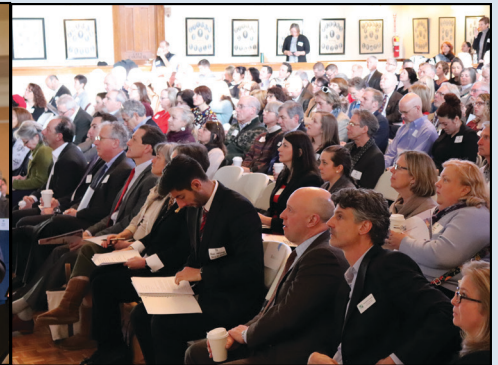
ECCF presents the State of the County September 2020

Visit eccf.org/celebration for more information.