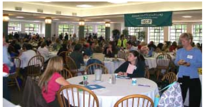
Youth at Risk 2007 Conference

The Youth-At-Risk Initiative provides a collaborative network among the numerous Essex County agencies, which in various capacities serve at-risk youth and their families. Our goal is that this network will enable services for children to be delivered in a collaborative, continuous and comprehensive manner. YAR accomplishes this through a resource directory of the over 800 services in Essex County for youth and families-at-risk, educational programs, a website and technical assistance. YAR just completed its seventh annual Youth-at-Risk conference held at Endicott College on June 13, 2007 for over 600 professionals who serve Essex County youth and families. For more information, visit www.essexcountyyouth.org .