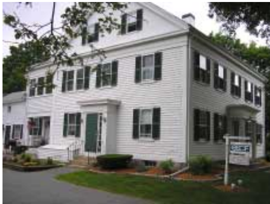
Essex County Community Foundation 15 Cherry Street, Danvers, MA

Throughout the United States, some 700 community foundations act as a focal point, convener and enabler for philanthropic activities in the regions they serve. In the same way, the Essex County Community Foundation serves the 34 different communities that comprise Essex County.